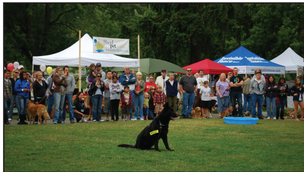
Attendees watch a demonstration by the Blaine & Bellingham K-9 Police units.

Have a question? Interested in volunteering? Email us at alternativehumanesociety@gmail.com , or call 671-7445.