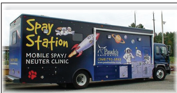
A state-of-the-art mobile surgical unit. Thank you Pasado's Safe Haven and ClayForEarth for making it possible.

According to the AKC in 2007 the most popular names for dogs are Lady and Bear.