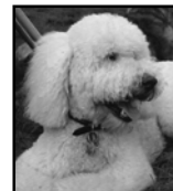
Boule President for the year