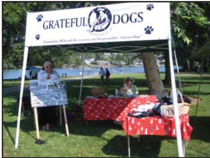
Paws and Claws

Well our gorgeous hot summer came to a screeching halt Labor Day weekend. Dog Days of Summer at Lake Padden was literally blown away by heavy gusts of wind. We were there at 8 AM