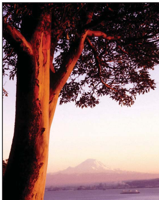
A stately madrona tree overlooking the water.