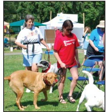
AHS's Paws and Claws Expo.

This was the scene at AHS's Paws and Claws Expo as people played musical chairs' with their dogs. The dogs had to sit before their guardians could sit, you see, and whoever was left standing was OUT!