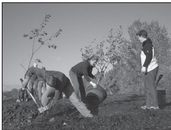
Grateful Dogs members planting trees for the future October 2008, Squalicum Creek Park

Our parks and the trees in them are truly gifts from the past. Bloedel Donovan Park was created in 1946. The silver maples that provide so much shade there are 60 years old. On a warm summer morning I am truly grateful for those trees and the shade they provide while my dogs play with their friends. If I need to walk them in the