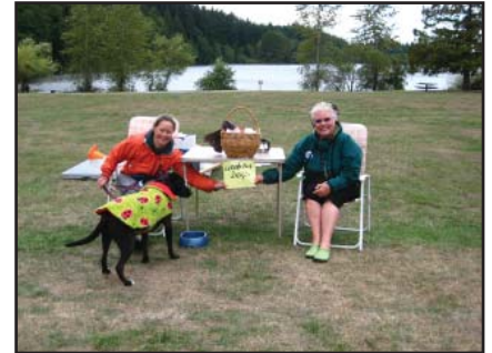
Dog Days of Summer

It has been a fun rewarding year being "President Boule" for a year.