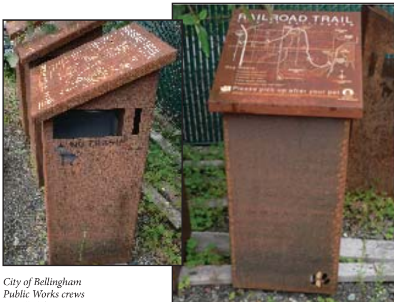
City of Bellingham Public Works crews installed five new dog waste collection stations along Railroad Trail from Memorial Park on King Street to Electric Avenue near Lake Whatcom.

The City of Bellingham Public Works crews installed five new dog waste collection stations along Railroad Trail from Memorial Park on King Street to Electric Avenue near Lake Whatcom.