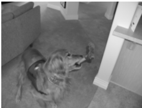
"Summit demo dog Baker, retrieves the cane"